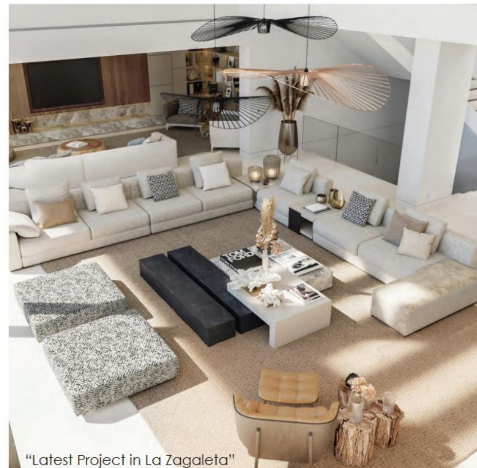
"Latest Project in La Zagaleta"